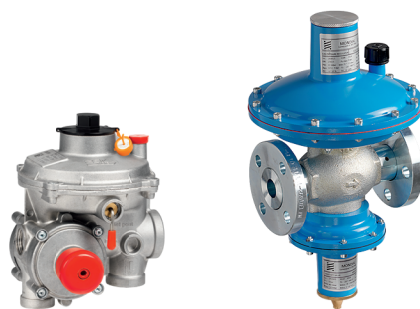
Gas pressure regulators