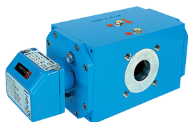
Rotary piston gas meters