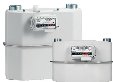
Diaphragm gas meters