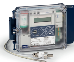
Electronic volume correctors