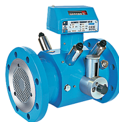
Turbine gas meters